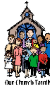
Our Church Family

$400 International — North Eastern Presbyterian Women. /This will be forwarded to Malawi to purchase mosquito netting for the prevention of the spread of malaria.