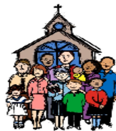
Our Church Family